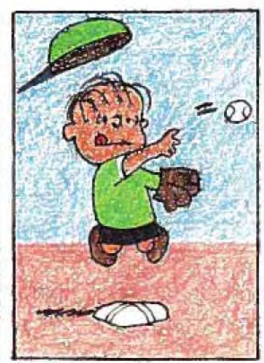
Adapted from "Who do you think you are, Charlie Brown?" Coronet Books 1972